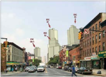
Photomontages from the DEIS showing proposed buildings mislocated (left) compared to verifiable photo simulations done by the ESC showing buildings in their correct location (right).